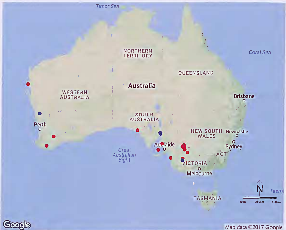
Figure 1. Map of known locations of Monocarpus sphaerocarpus in Australia, indicated by red filled circles, including locations of populations sampled for this study as blue filled circles

Samples of Monocarpus sphaerocarpus were obtained from a number of recent collections from previously known localities in Western Australia and Victoria, as well as from two new localities in South Australia (see Table 1). In total, 12 new samples were collected (five from Western Australia, five from Victoria and two from South Australia) and compared to a previously studied specimen from Western Australia (Forrest et al. 2015). DNA extractions were performed using a Qiagen DNeasy Plant Mini kit following the manufacturer's instructions (Qiagen, Melbourne, Victoria, Australia). Five plastid gene regions were amplified: rbcl , rpoC1 ,